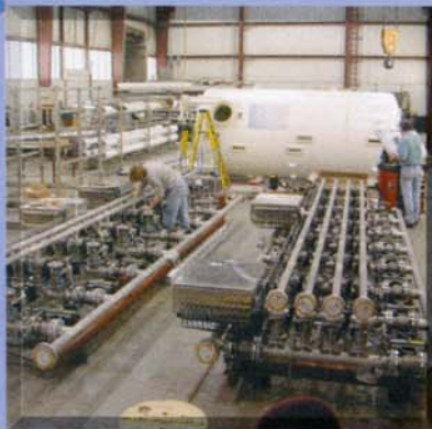
Building the SMB