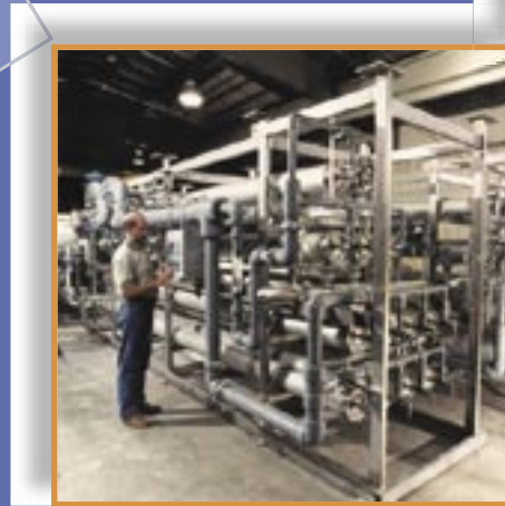
Ultrafiltration Membrane System